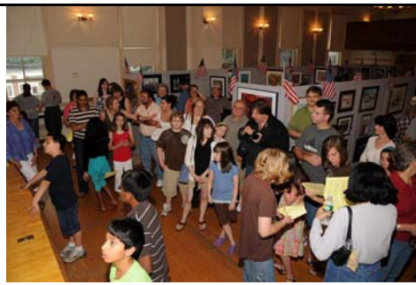
Waiting for Awards